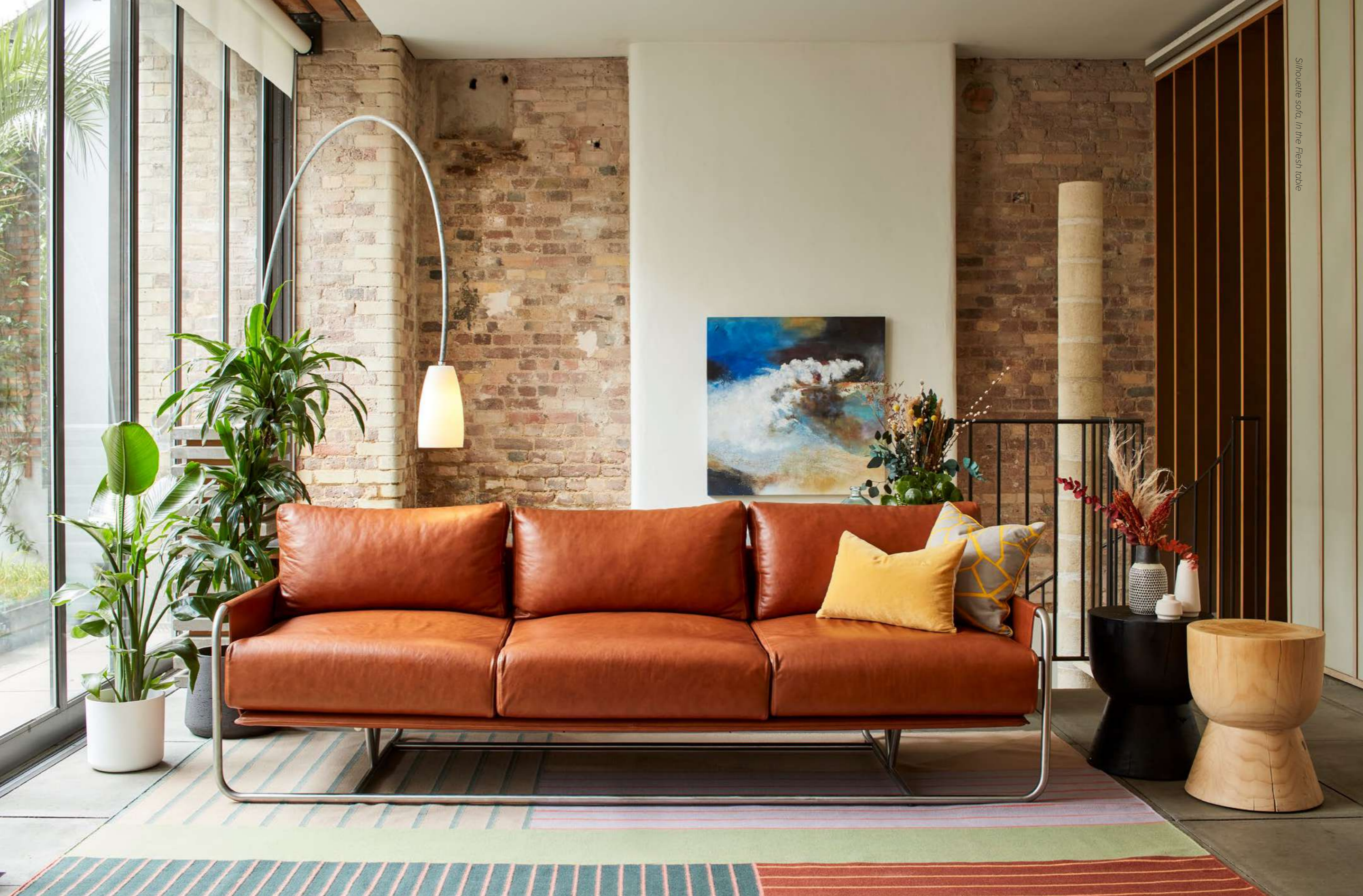
Silhouette sofa. In the Flash table