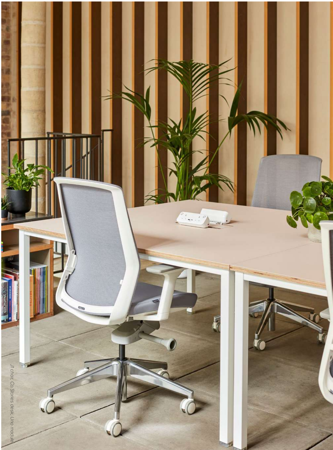
J1 chair, Co-Stories desk, Uno module