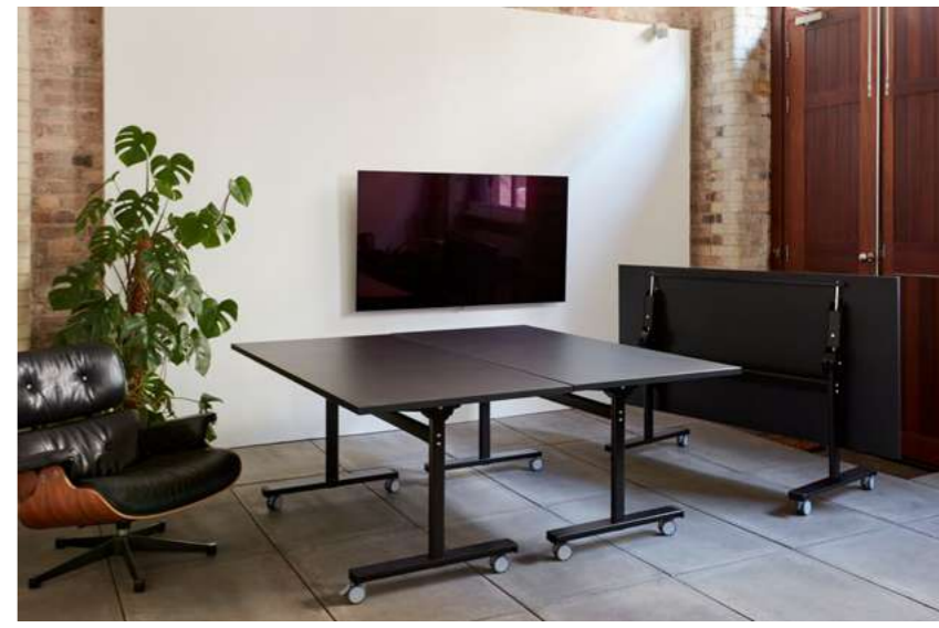
Hybrid furniture to work around the activities and teams need, and not the other way around.