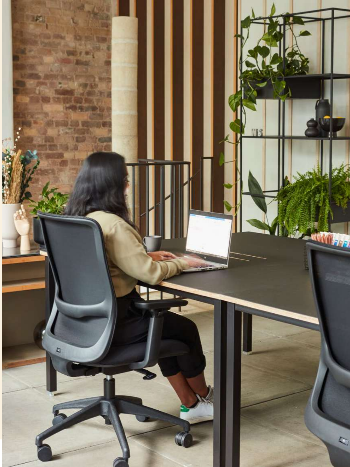
L21 chair, Co.Stories desk

The open workspace remains a centre point where we settle for the day or touch down for a few hours. It gives the set space and mental structure to concentrate on our to-do but also allows for quick conversations to boost agility and innovation.