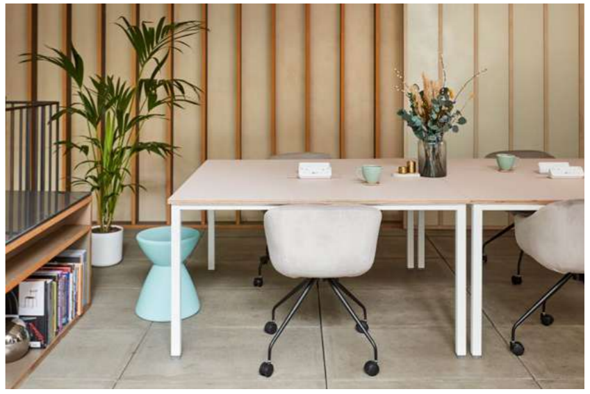
Noir chair, Polo stool

Ergonomic, efficient and effective, Workstories offers a range of highly engineered task and meeting chairs.