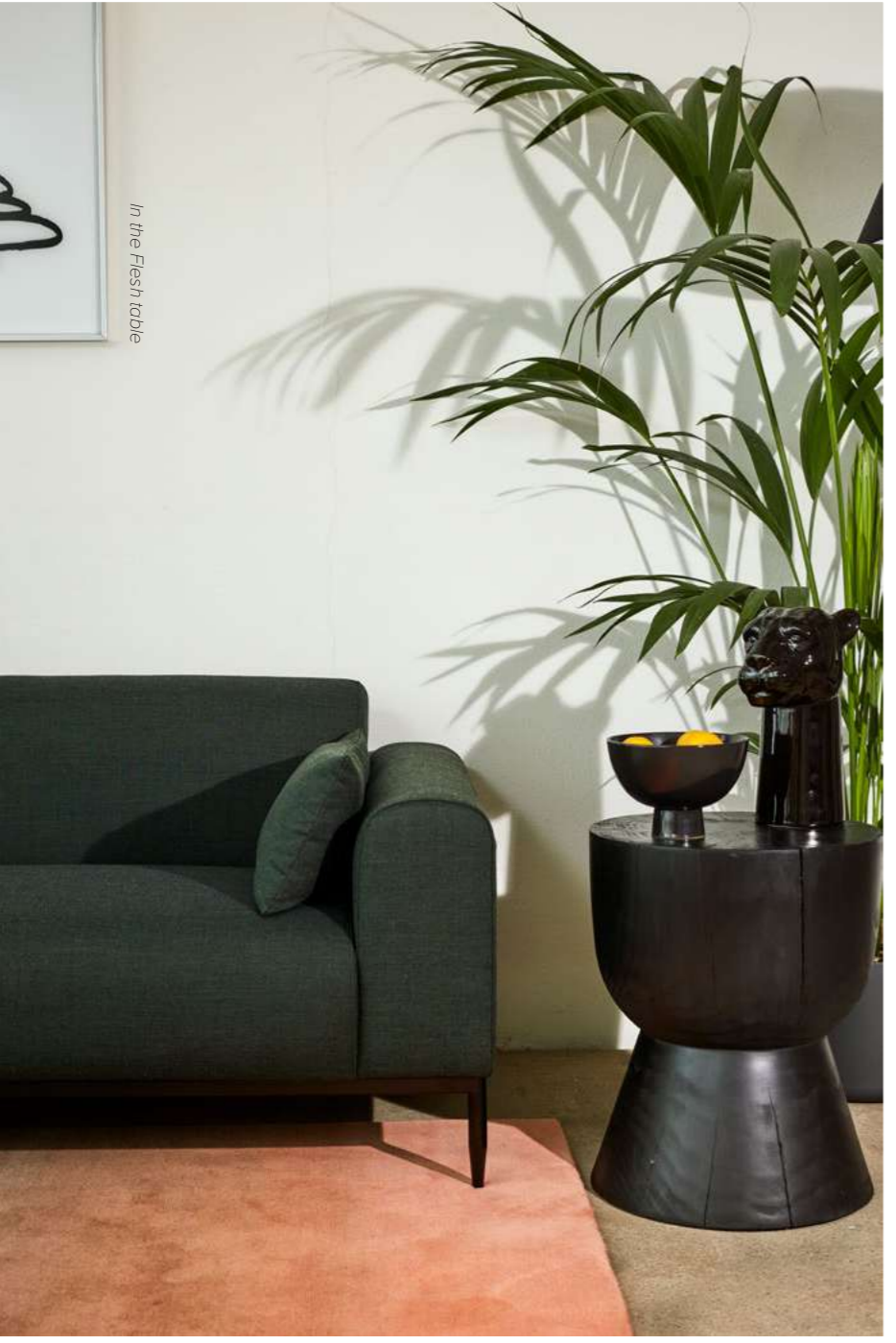
In the Flesh table

Homelike environments – where we truly enjoy spending time – incorporating soft shapes, tactile textures and materials evoke a sense of warmth, comfort and familiarity. The workspace is now a multi-sensory space with a story to tell.