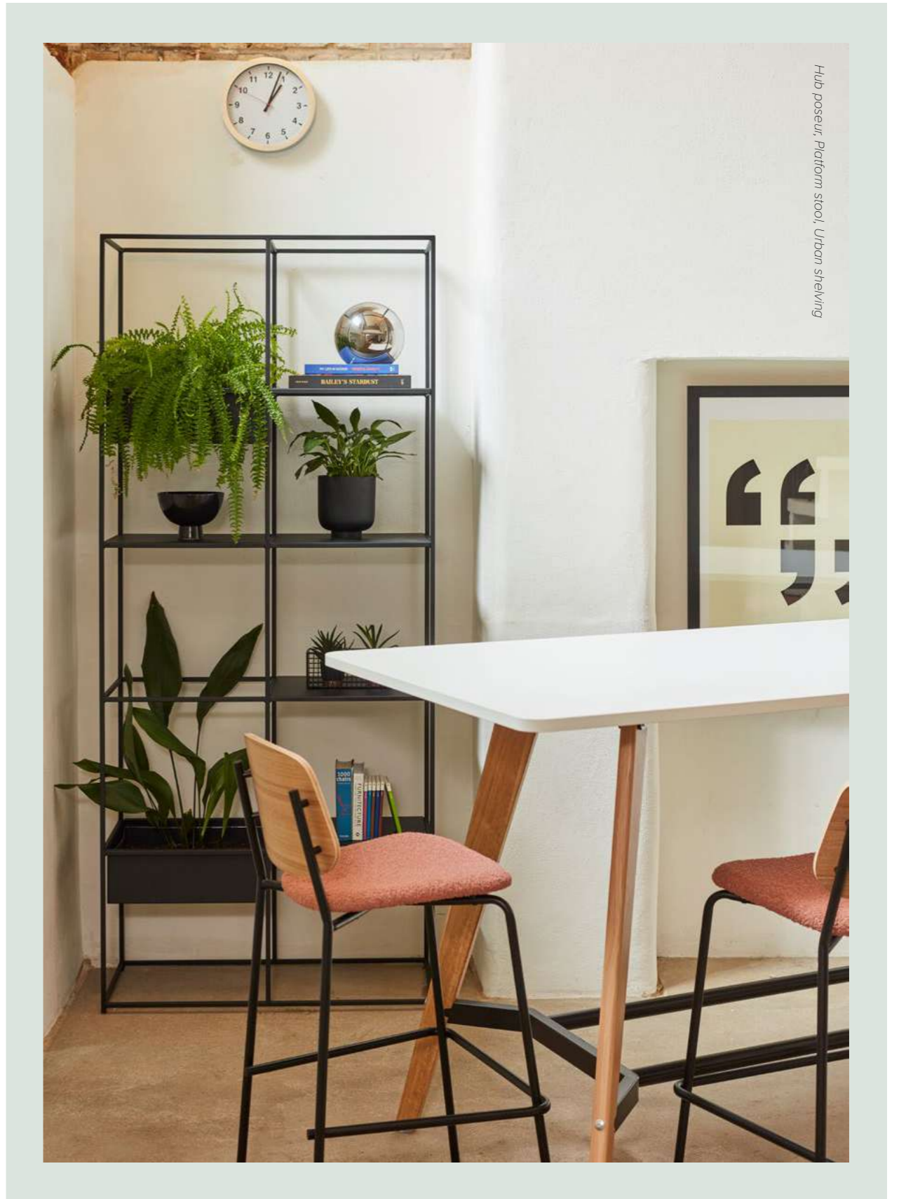
Hub poseur, Platform stool, Urban shelving

Creating a palette of places to work from, collaboration spaces encourage people to be more engaged with their colleagues, while changing postures and moving around throughout the day. Let's get the creativity flowing!