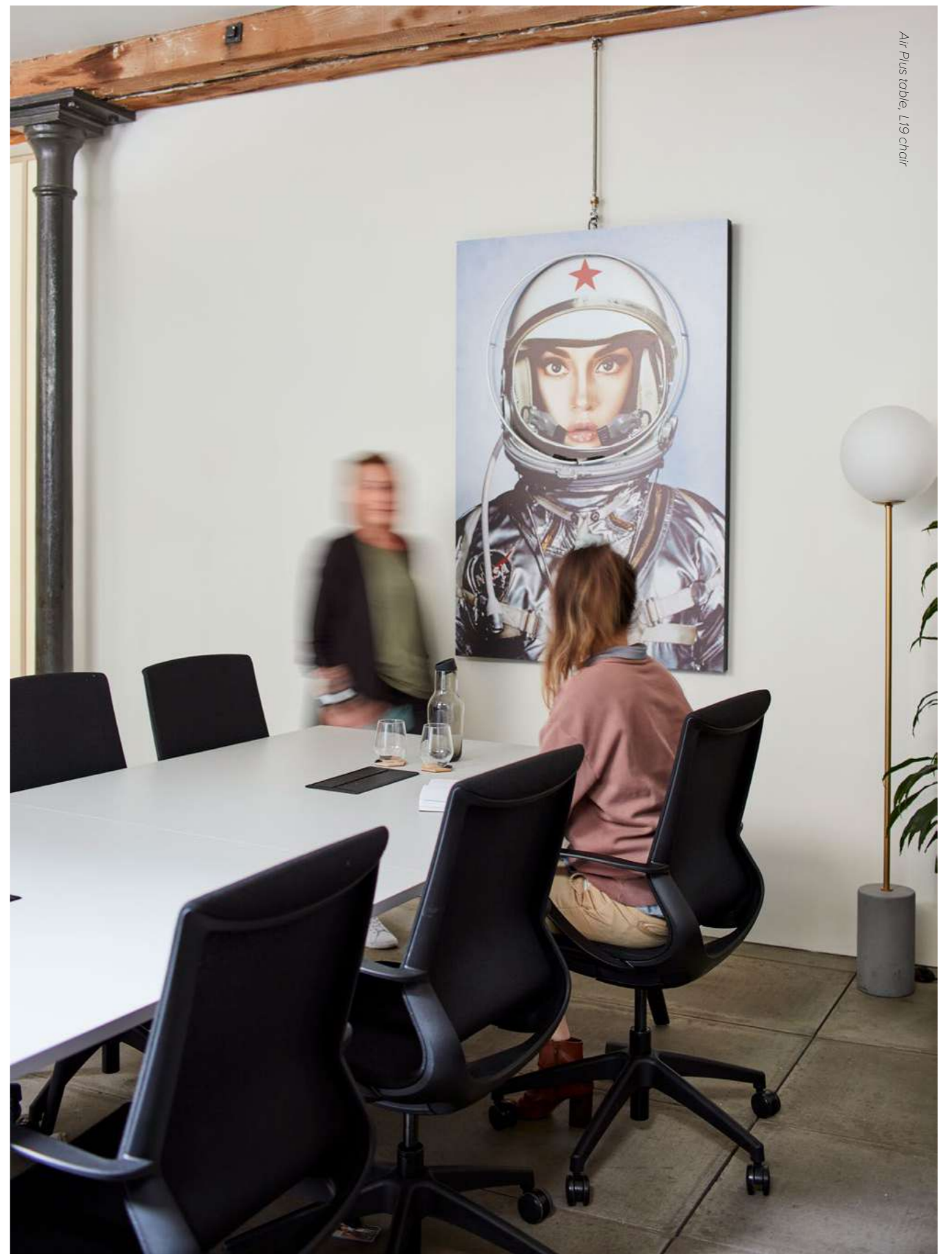
Air Plus table, L19 chair

Beautifully designed and simply functional, Workstories seating collection is built for spaces that get used day in and day out.