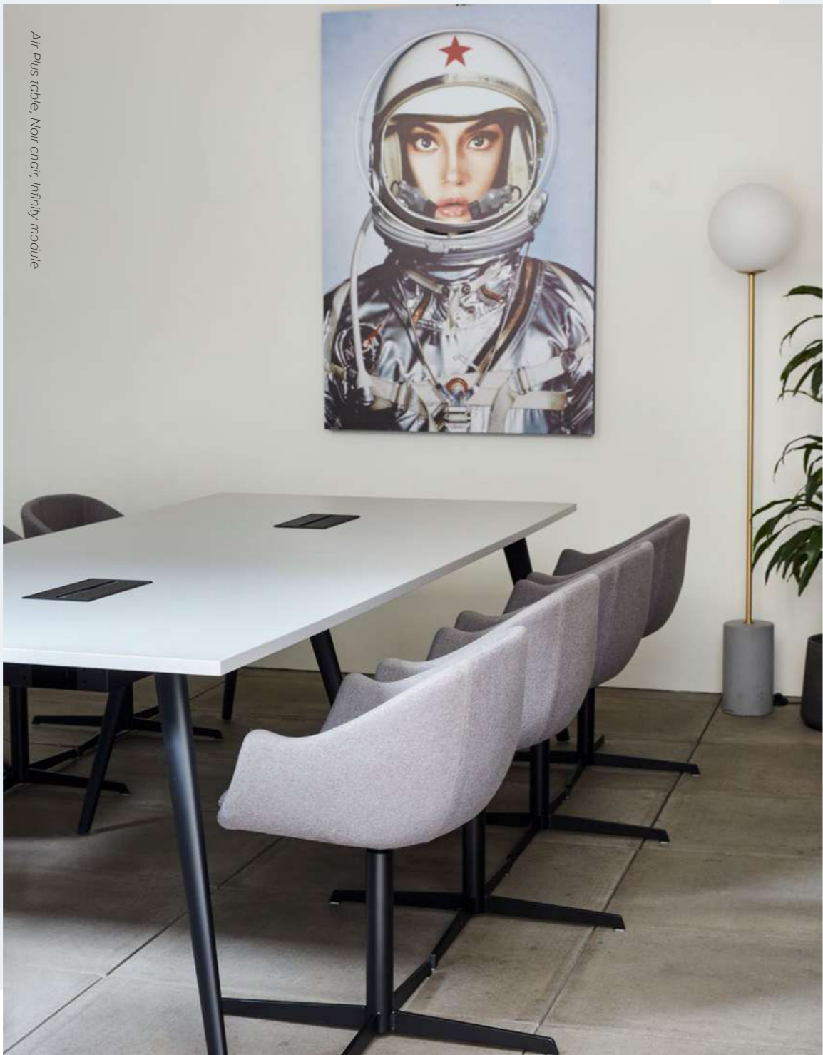
Air Plus table, Noir chair, Infinity module