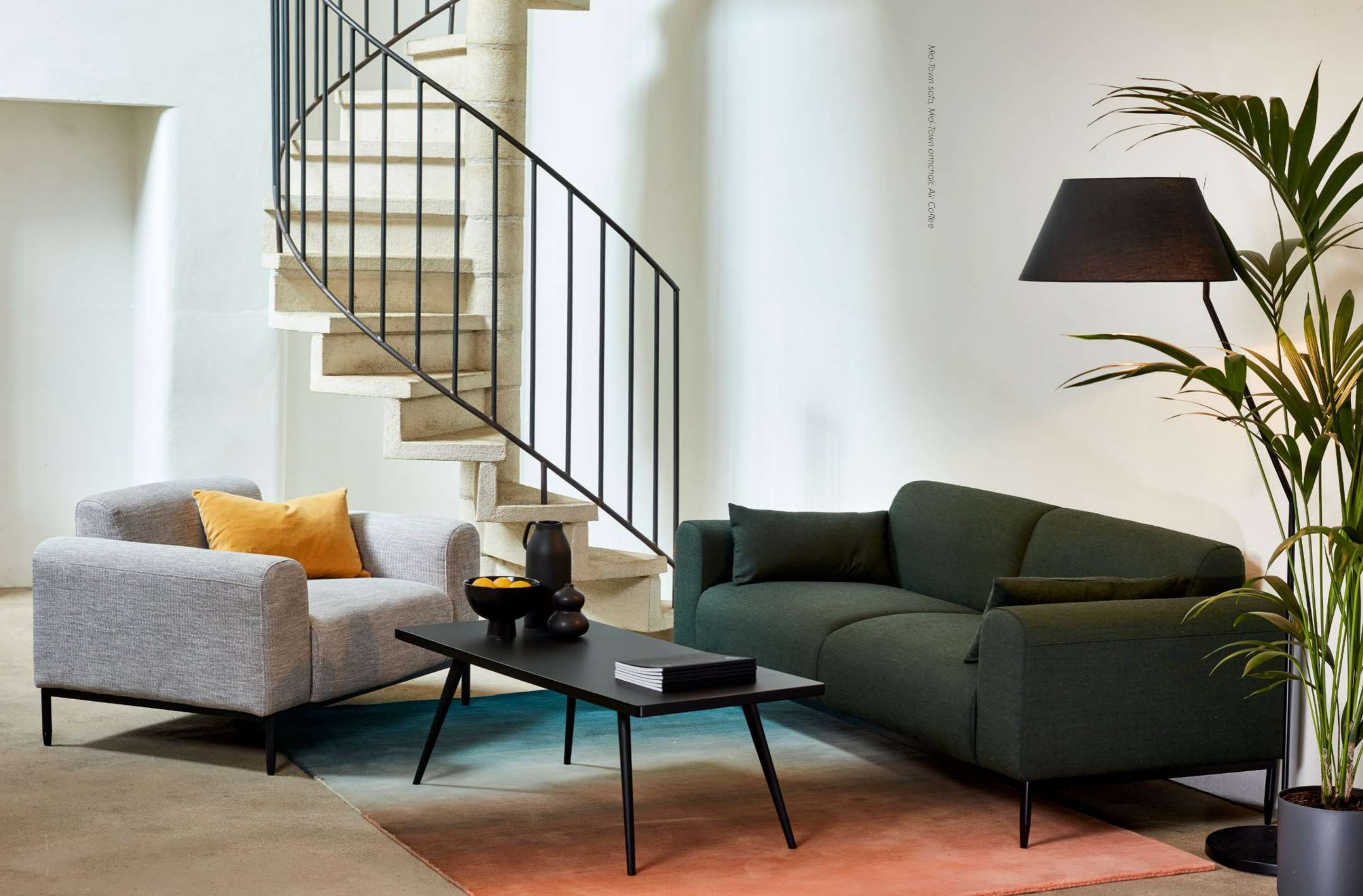
Mid-Town sofa, Mid-Town armchair, Air Coffee