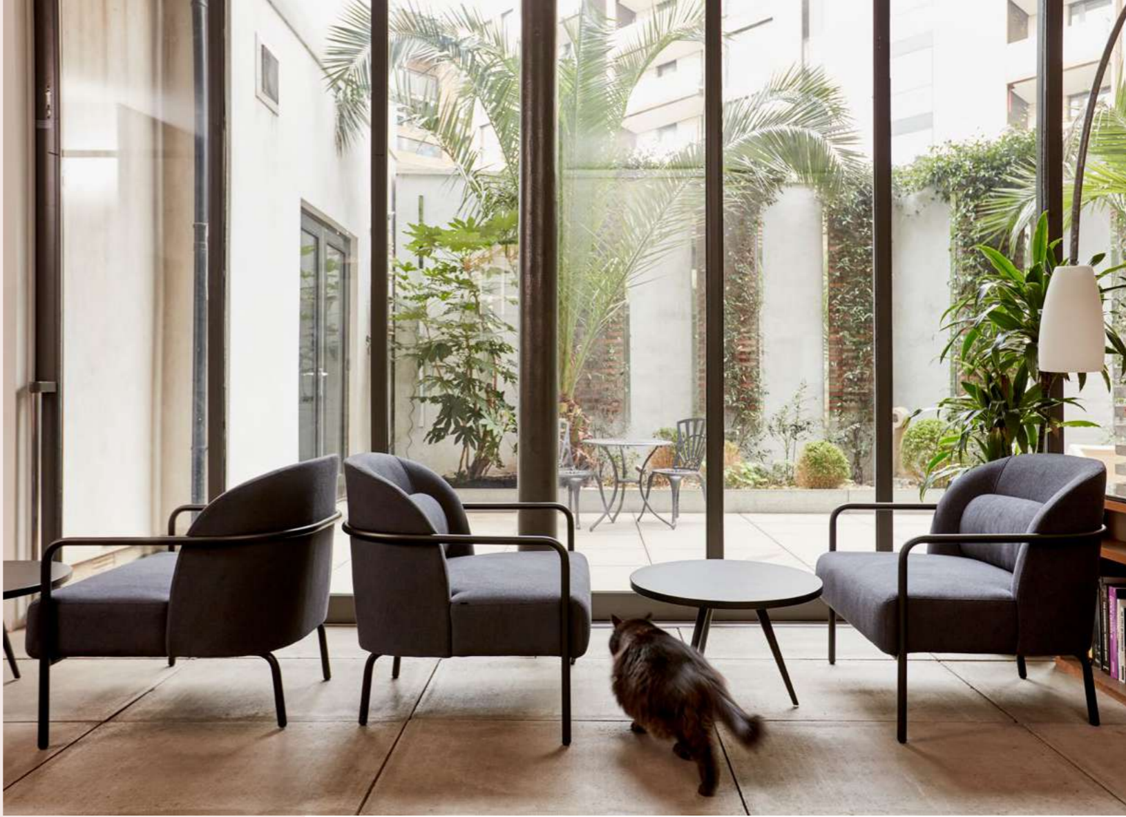
Circa armchair, Air Coffee table