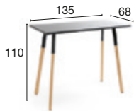
TABLE H. 110 CM